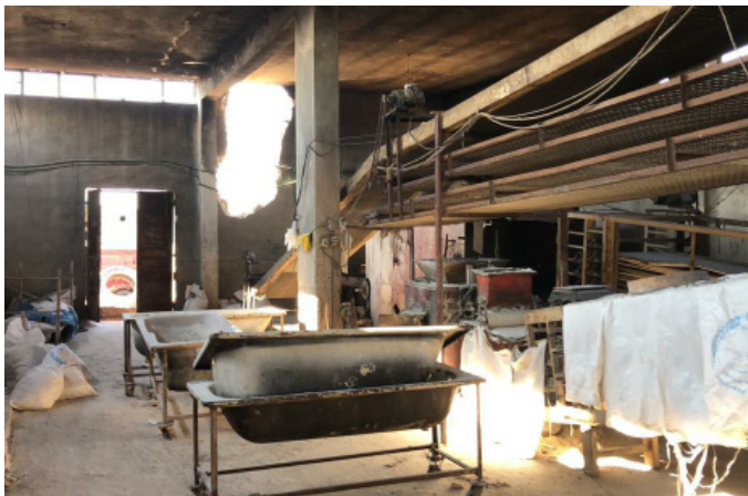
Bakery of Rebiat, the only in the area, was destroyed by shelling on December 6, 2022.