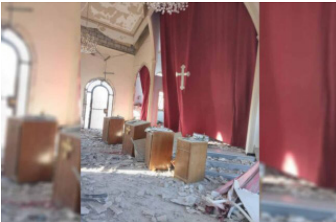
Assyrian church in Tawil destroyed by shelling of Turkish mercenaries in May 2022.