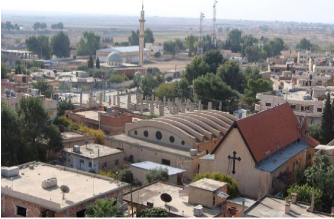
The town of Til Temir